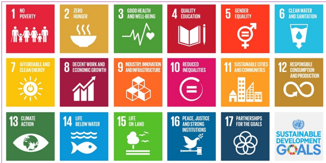
FIGURE 3: United Nation’s Sustainable Development Goals (UNSDGs)