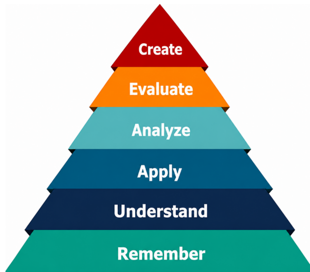
FIGURE 2: Six levels of the Cognitive Domain